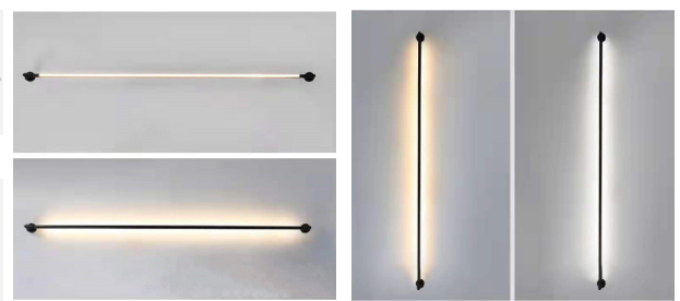
Light Angle Efficiency